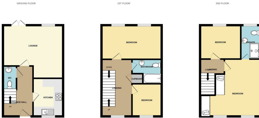
31 GOUGH GROVE, LONG EATON

Whilst every attempt has been made to ensure the accuracy of the floorplan contained here, measurements of doors, windows, rooms and any other items are approximate and no responsibility is taken for any error, omission or mis-statement. This plan is for illustrative purposes only and should be used as such by any prospective purchaser. The services, systems and appliances shown have not been tested and no guarantee as to their operability or efficiency can be given. Made with Metropac CS2024